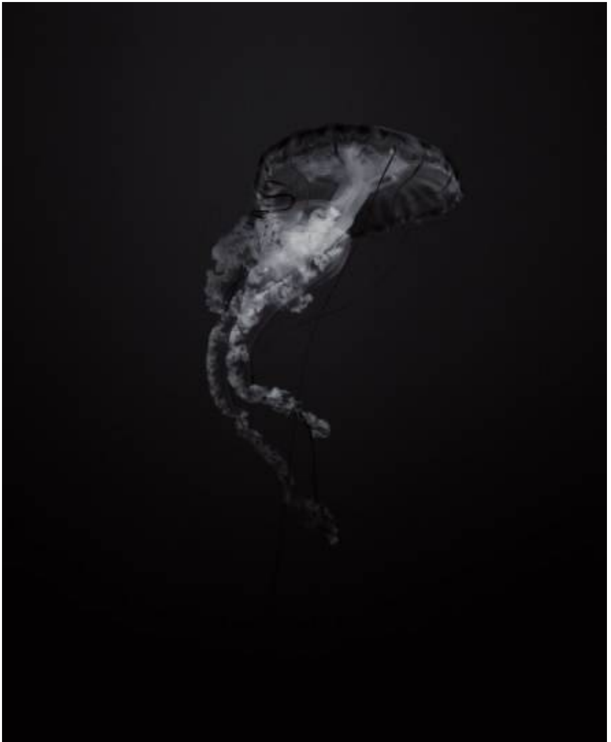
Christopher Williams, Pacific Sea Nettle, Chrysaora Melanaster, Long Beach Aquarium of the Pacific, 100 Aquarium Way, Long Beach, California, September 5, 2007, 2008, gelatin silver print, 61 × 50.8cm.